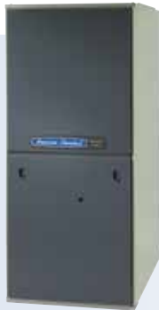
Platinum 95 95 Comfort-R™ Variable-Speed, Modulating, Communicating

Our most efficient and powerful gas furnace just might be our most comfortable too. With AccuLink™ communicating capability, continuous Comfort-R™ mode and an array of other innovative features, the Platinum Series gives your home maximum efficiency with controlled comfort.