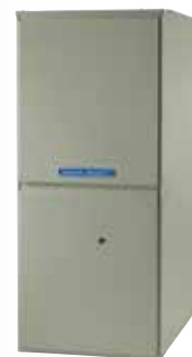
American Standard 92 90 Single-Stage