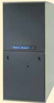
Gold 95v 95 Comfort-R™ Variable-Speed

High quality and high efficiency mean a high standard of comfort for your home. The Gold Series offers just that. Whether you choose variable-speed technology, or a two-stage offering with the power to increase your overall system efficiency, you can be sure that each one contains American Standard's quality craftsmanship.