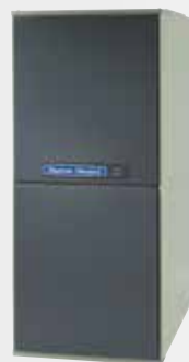
Silver 95h 95 High Efficiency Single-Stage

Designed with value in mind, the Silver Series provides you with the comfort you want, the efficiency and durability you need and, of course, the American Standard commitment to quality you expect.