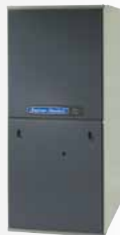
Silver 95 95 Single-Stage