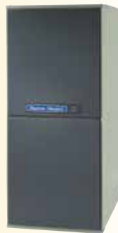
Gold 95 95 Two-Stage