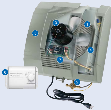
Platinum Whole-Home Humidifier shown. Other models may vary.

Works with the automatic control by monitoring the outdoor temperature and signaling when to add the correct amount of humidity to keep you completely comfortable. (Not shown.)