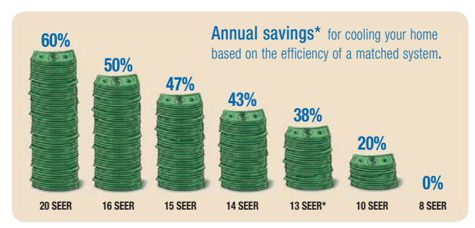
*Minimum efficiency established by the Department of Energy. The majority of systems installed prior to 2006 are 10 SEER or lower. Potential energy savings may vary depending on your lifestyle, system settings, equipment maintenance, local climate, home construction and installation of equipment and duct system.