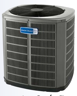
AccuComfort™ Platinum 18