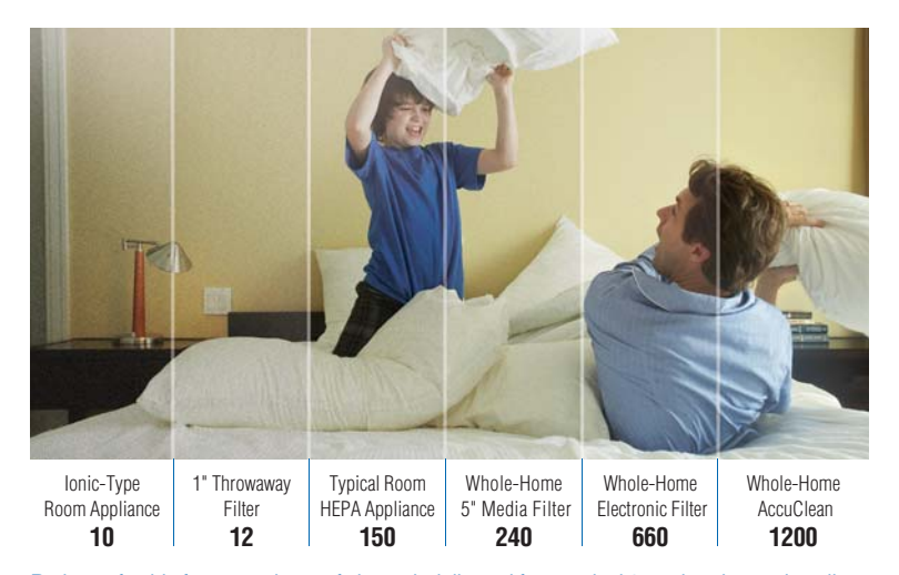
Ratings of cubic feet per minute of clean air delivered for a typical 3-ton heating and cooling system: the higher the value, the more effective the air cleaner.

Want 99.98% clean air? Then choose the home air filtration system that gives 110% – American Standard's revolutionary AccuClean.™ By removing up to 99.98% of unwanted allergens down to .1 micron from the filtered air, AccuClean is 100 times more effective than a standard 1" throwaway filter. Simply put, AccuClean works harder, so you and your family can breath easier.